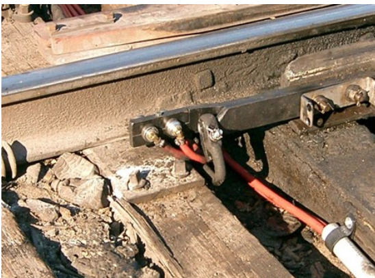
Concurrent test site installation in yard