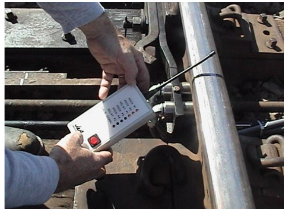
Remote status monitor provides sensor and relay information from up to 1,000 feet away