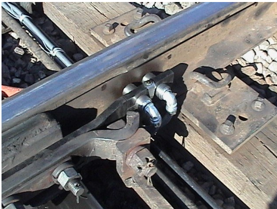
Sensor configuration for switch point detection. Both normal and reverse points are detected. Other applications include Bridge Signal and Dragging Equipment Detection