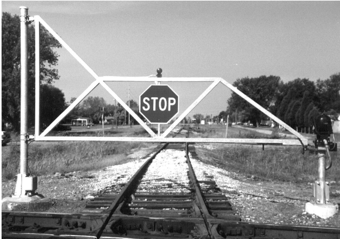
SMASH GATE 250016-000