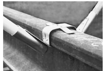
Unit snaps under the head of the rail on both sides to securely hold flags