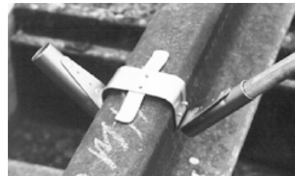
Upper tension bar keeps unit stabilized and tight for all three (3) rail sizes