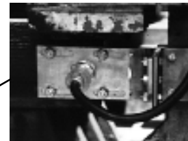
Lock bar engagement