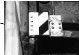
Rail surface detection