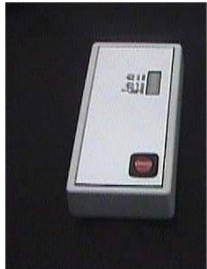
Remote status monitor provides sensor and relay information from up to 1,000 feet away

Call J&A Industries for more details or a demonstration